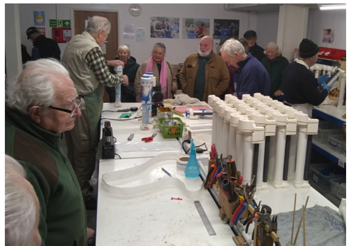
Members of the Derby Ramblers watching the filter assembly team at work.

Have a day out! Bring your group to visit Aquabox – just go to www.aquabox.org , click on 'Find out more', and then on 'Visit the depot'. We're looking forward to welcoming you.