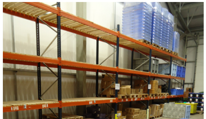
February 16: The Aquabox warehouse – the shelves are bare because everything is shipped as soon as it's ready!