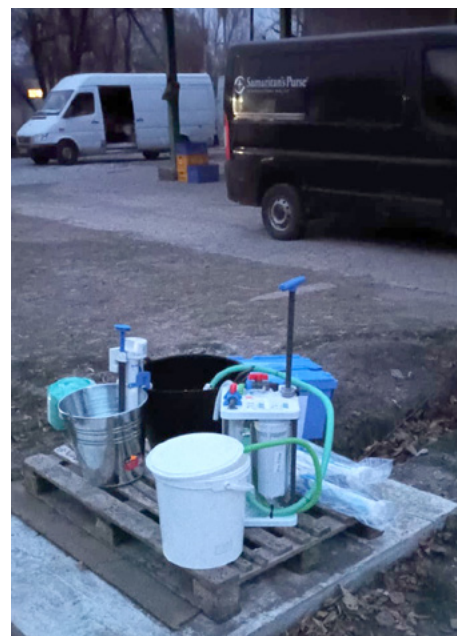
An Aquabox community filter in use at a church in Ukraine.

potential to convert as much as 700 million litres of polluted water into safe, clean water for drinking, for cooking and for washing. But as well as that, we have sent a total so far of 70 community filters, intended for use in schools, hospitals, clinics and community centres.