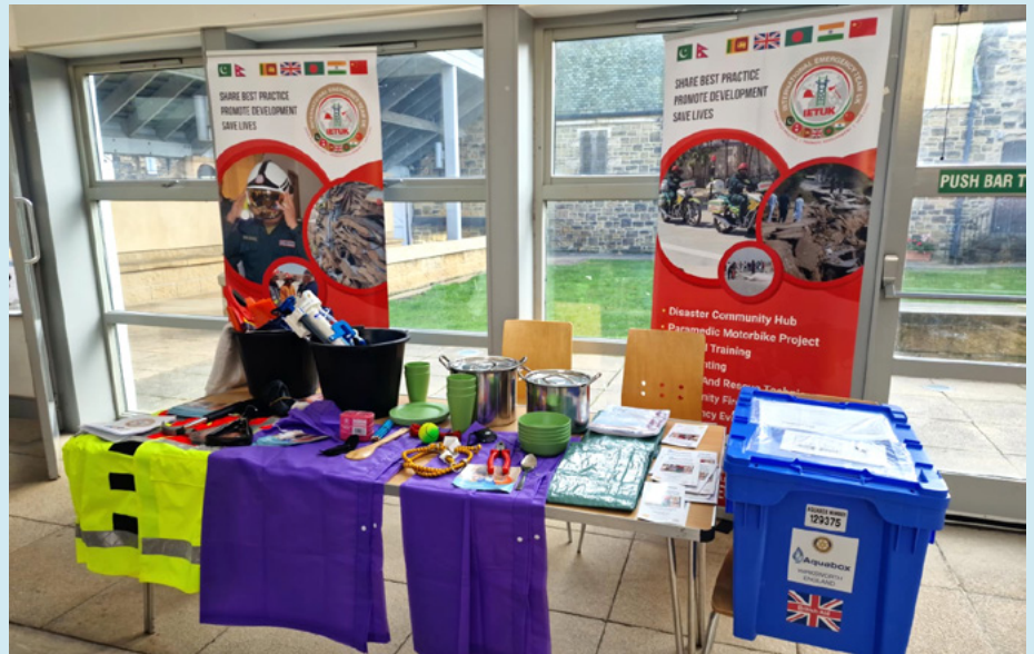
Our Asian Fire Service Association partners exhibiting at a fund-raiser for Pakistan.

Total value of these two shipments was more than £50,000, funded entirely