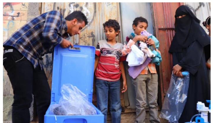
And this is why it all matters: Aquabox aid being delivered to refugees in Yemen.