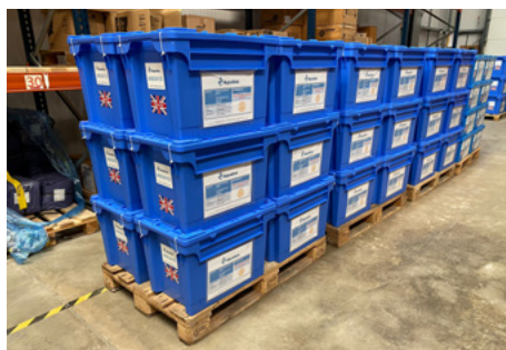
A consignment of filters ready for despatch, funded by the Rotary Club of Potsdam.

Since the Russian invasion began, Aquabox has sent almost 1,400 family filters to Ukraine. They alone have the