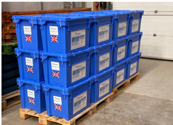
January: Another consignment for Ukraine, funded by the Rotary Club of Stade in Germany.

It is now widely expected that the war in Ukraine is likely to escalate. Meanwhile there is no end in sight to the violence in Yemen; natural disasters will continue to occur; and of course we now face the challenge of the earthquake in Turkey and Syria. The demand for our water filters and humanitarian aid isn't going to let up – and neither are we!