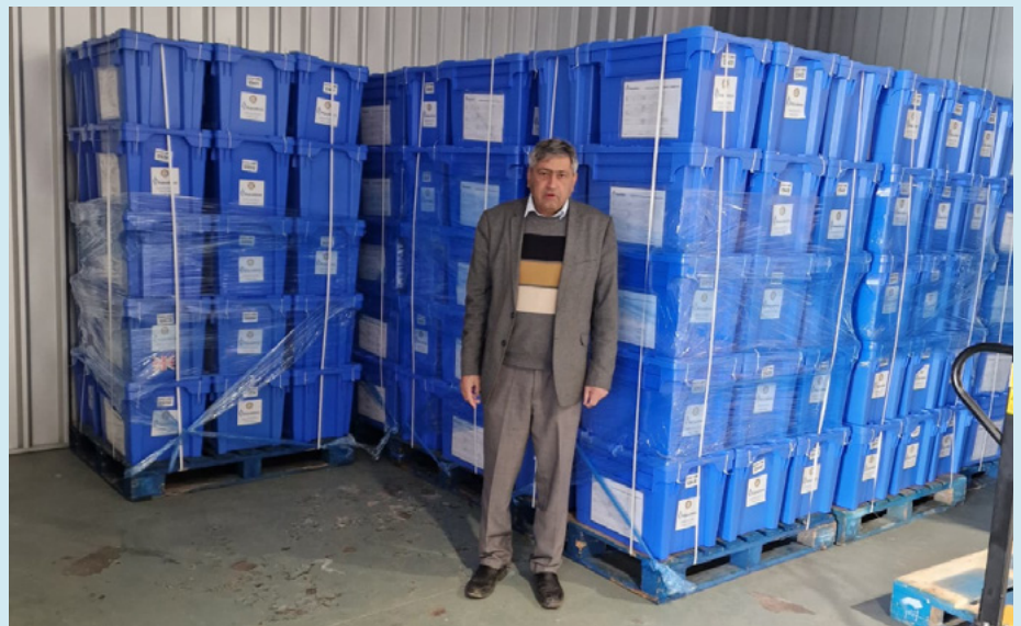
Aquabox aid, ready for distribution by the Kazguma Health Welfare Trust.