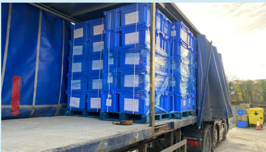
Another shipment of aid leaves the Aquabox depot, destined for Pakistan.

by donations – Aquabox doesn’t get any government funding.