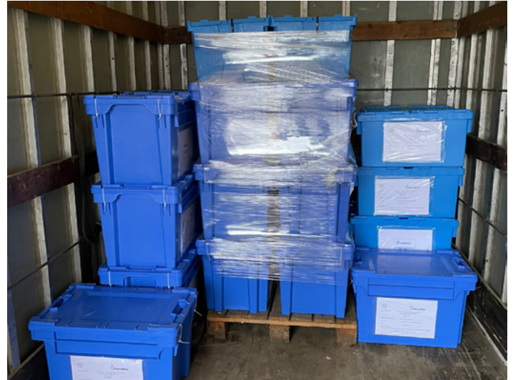
November: A consignment of filters leaves the depot on its way to Lviv.

Remember, Aquabox is funded entirely by donations. To support our work, go to Aquabox.org , and click on 'donate'. And remember too that Aquabox is run almost entirely by volunteers – so every donation we receive will help to make a difference to the life of someone, somewhere, who is in desperate need.