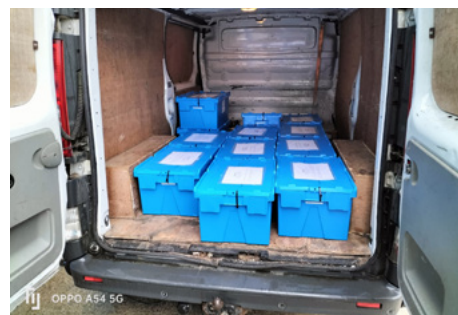
Another consignment, community filters this time, on their way to Ukraine.

All this costs money – and Aquabox is entirely dependant upon donations to keep its vital work going. If you can help, go to Aquabox.org , and click on 'donate'.