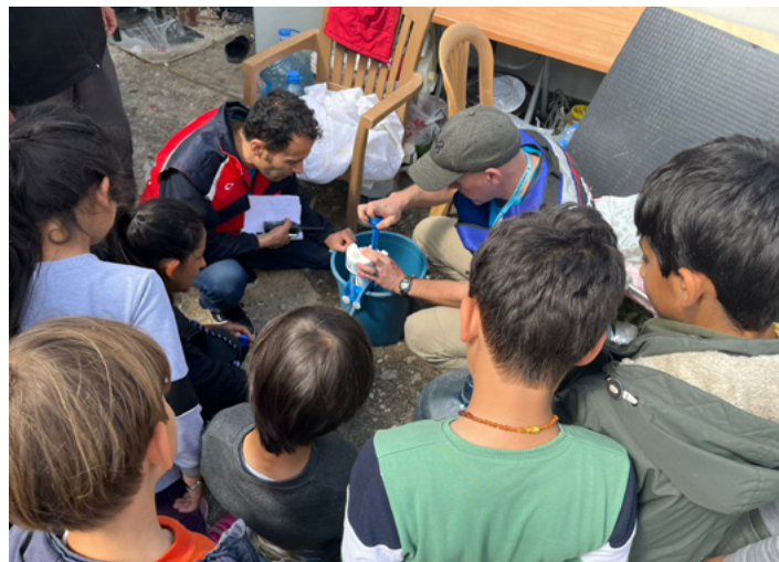
Project Orphan volunteers demonstrate the Aquabox filter.

Subsequently, we established a new partnership with Project Orphan, which has been working through the Turkish Ministry for Families and Social Services (MfFaSS). Project Orphan has been working in Hatay province with lone children and with families who have been displaced or lost their homes following the earthquake.