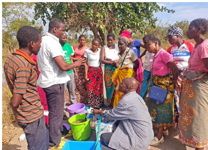
Seed Sowers Trust volunteers demonstrating how to use the Aquabox water filters.

By mid-March the government of Malawi had established 534 camps, to house more than half a million displaced people, and when