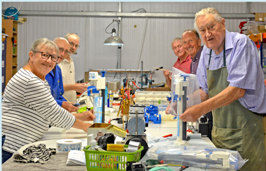
Volunteer filter assemblers - aiming to double production.